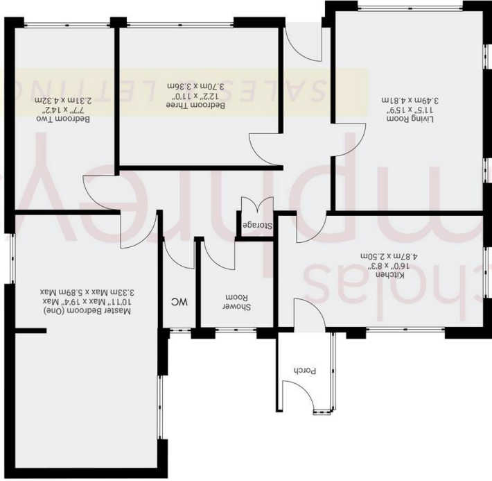
▲ Ground Floor